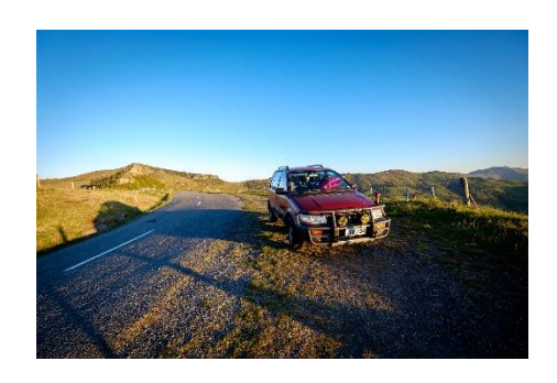
DAY ELEVEN QUEENSTOWN – HONG KONG (VIA SYDNEY)

At noon transfer to the airport for your flight to Sydney by QF 122 at 3:30 PM. Arrive 4:35 PM and connect to CX 138 at 10:20 PM.